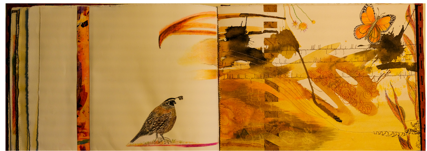
Book art by Joan Neubauer

Click http://www.windowalive.com/ for more about the artists in the new Windows Alive! exhibit..