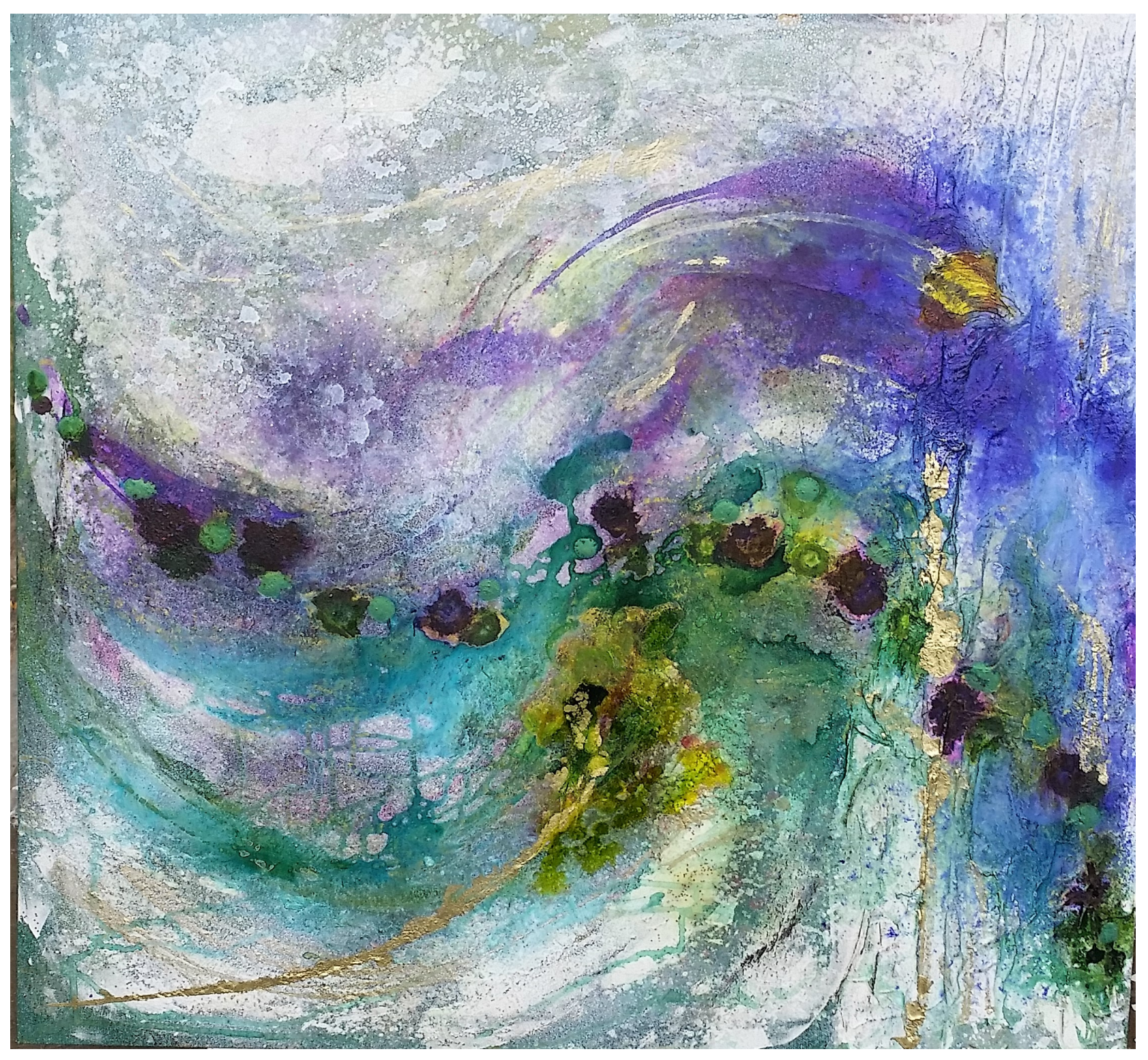
"Color Flow" by Sharon Azhderian Cox

Empty storefronts in Downtown Yakima will come alive again on Friday, April 5th when the talents of local artists are put on public display for the latest "Windows Alive!" installment.