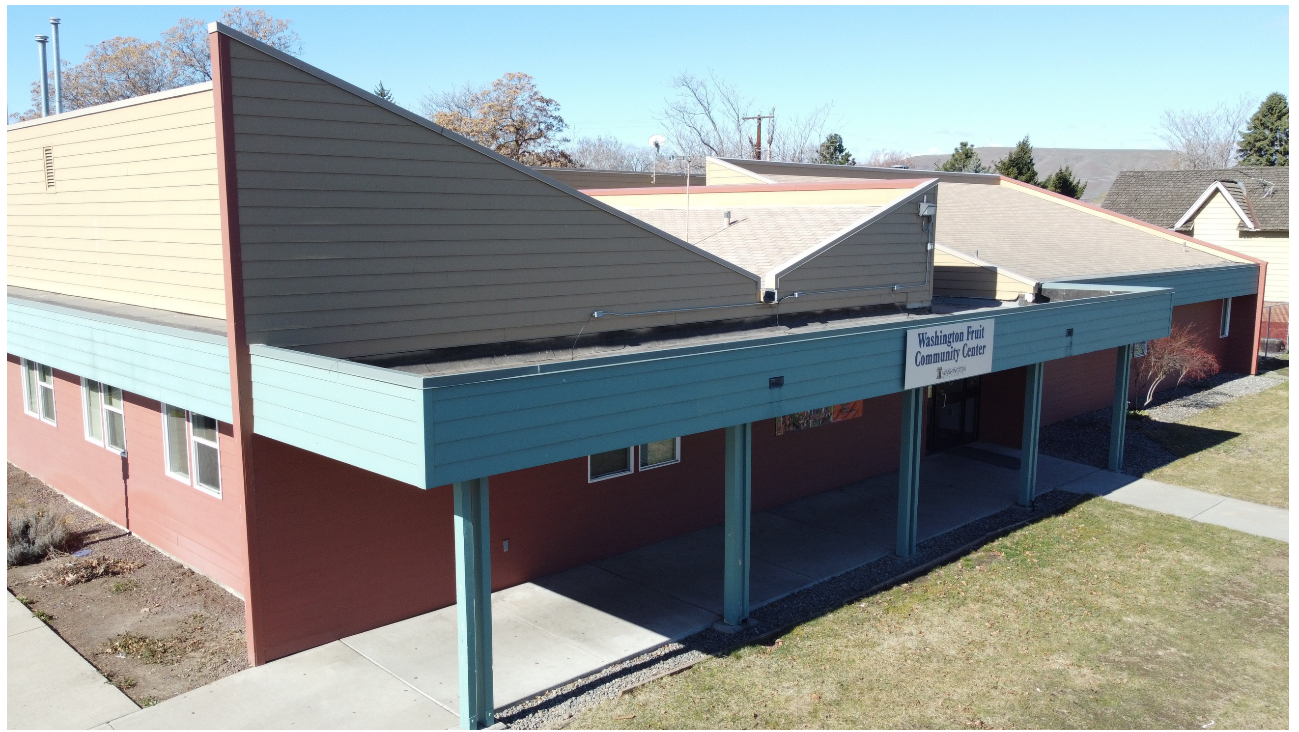
Washington Fruit Community Center will host Teen Zone this summer

For an updated list of locations, individuals are encouraged to visit www.YakimaVaccines.org .