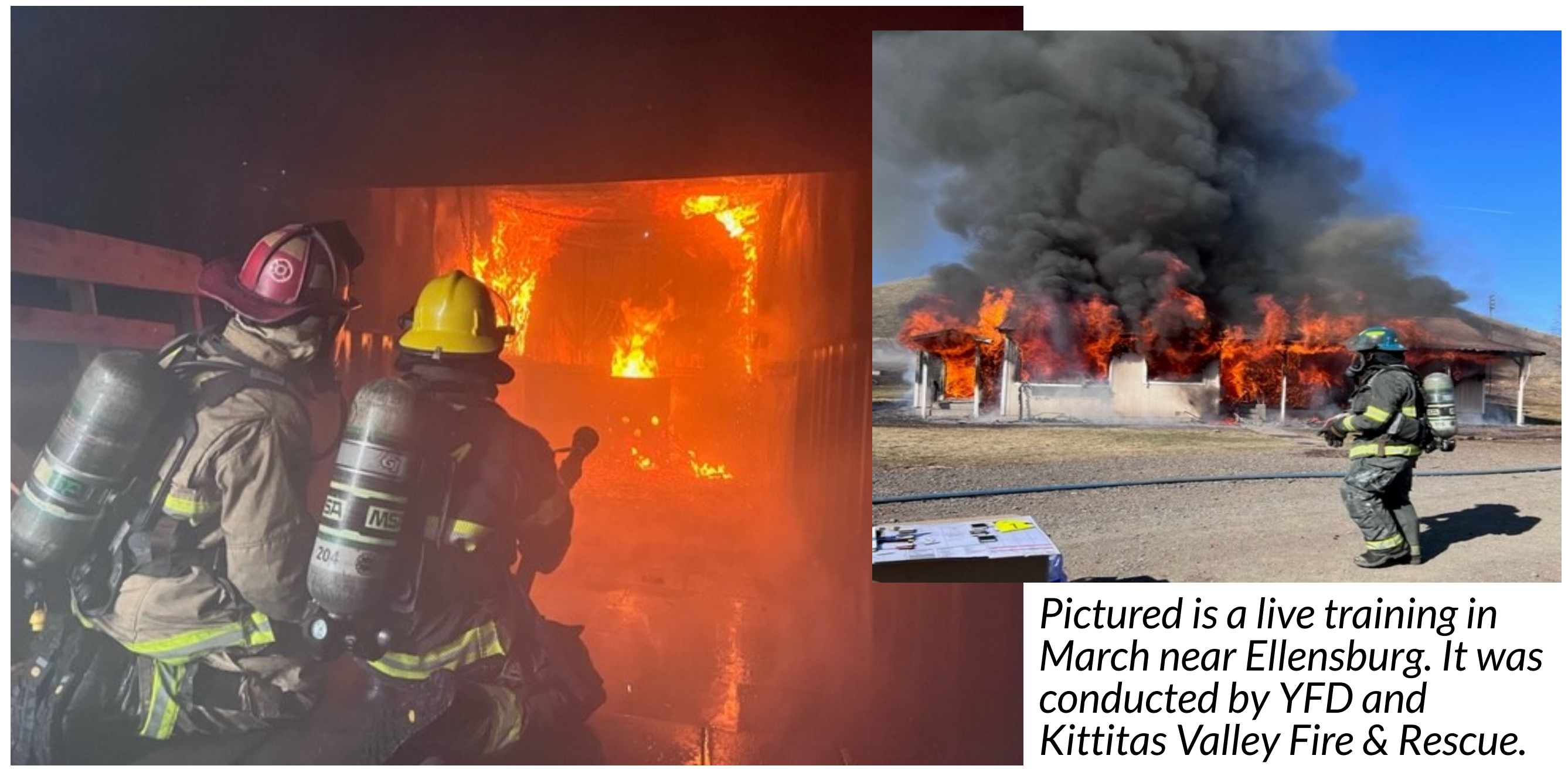
Pictured is a live training in March near Ellensburg. It was conducted by YFD and Kittitas Valley Fire & Rescue.

The Yakima Fire Department (YFD) and Kittitas Valley Fire and Rescue (KVFR) have partnered to form the Central Washington Fire Training Academy (CWFTA).