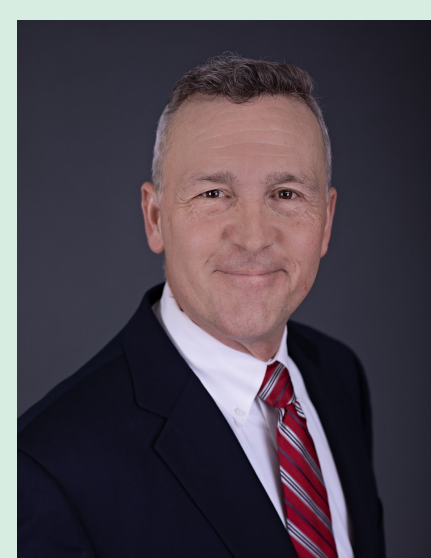
YKM Director page 2