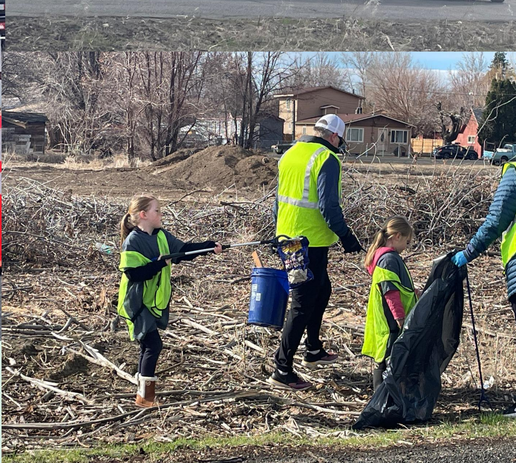
City of Yakima Public Works Department joined with local groups and volunteers for a free community cleanup on March 25th in the Barge Lincoln neighborhood. It was sponsored by City of Yakima Public Works, OIC of Washington, Poor Boys Auto Wrecking, Yakima County, Yakima Waste Systems, The Heights Church, Safe Yakima and Champions Centre.