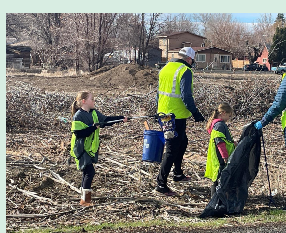
Community cleanup page 2