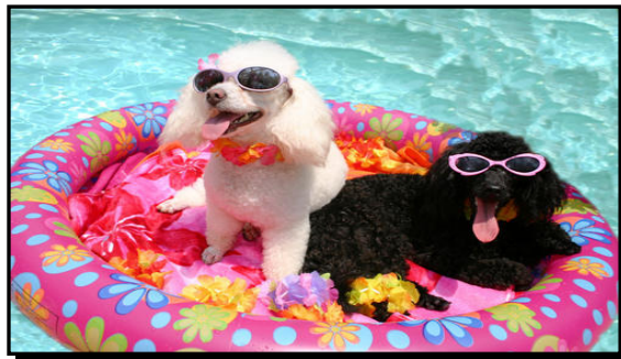
Simply lounging in the pool is another option for dogs and their owners at the Paws In the Pool event.

Bennett says there are few rules that dogs need to follow during the event. However, aggressive dogs are discouraged from taking part in Paws In the Pool in order to ensure that the day is fun for everyone.