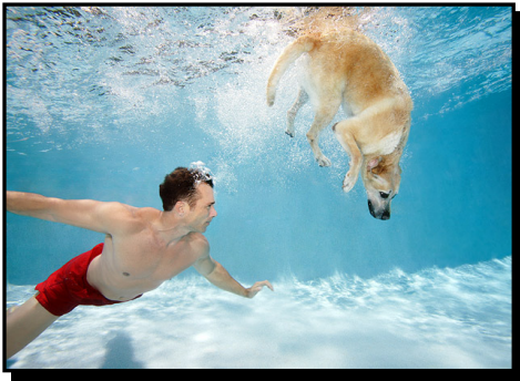
Both dogs and their humans enjoy the annual Paws In the Pool event at Franklin Pool.