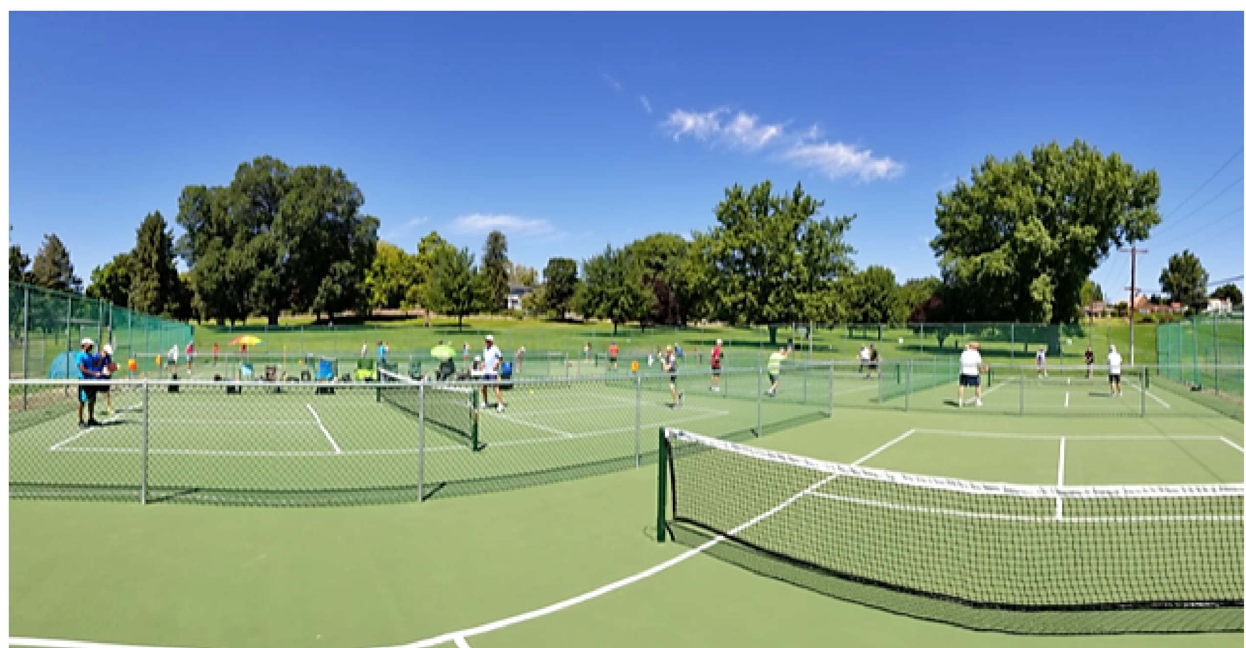
Pickleball courts at the City of Yakima's Franklin Park are available at no charge.

For more information visit http://www.windowalive.com