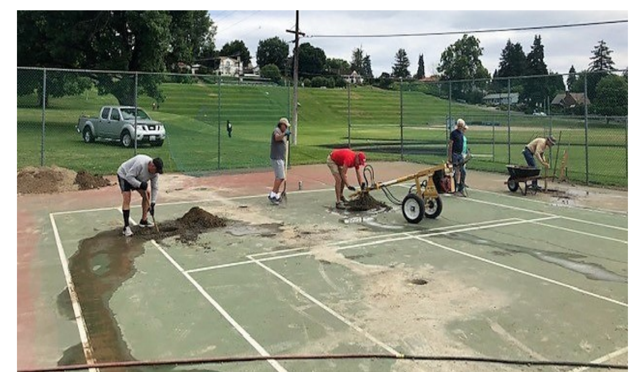
The Yakima Pickleball Club assisted with volunteer hours and funding.