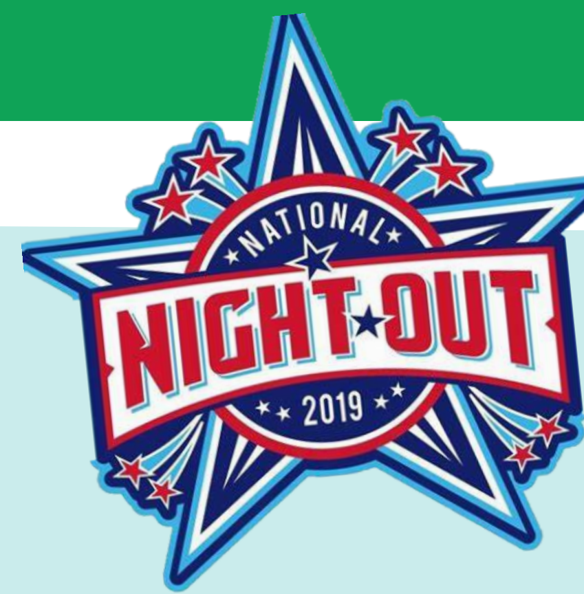
Page 2: National Night Out events on August 6th