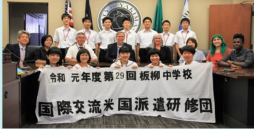
Page 4: Sister City exchange students visit Yakima City Hall