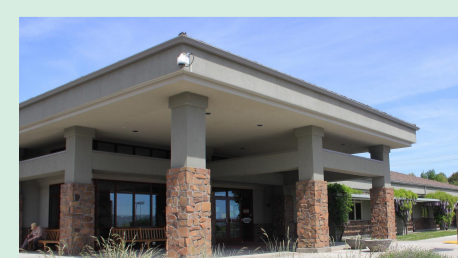
Harman Center School Supply Drive page 3