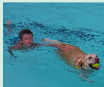
Paws in the Pool, page 2