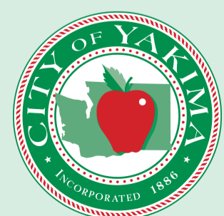
City Council summary page 3