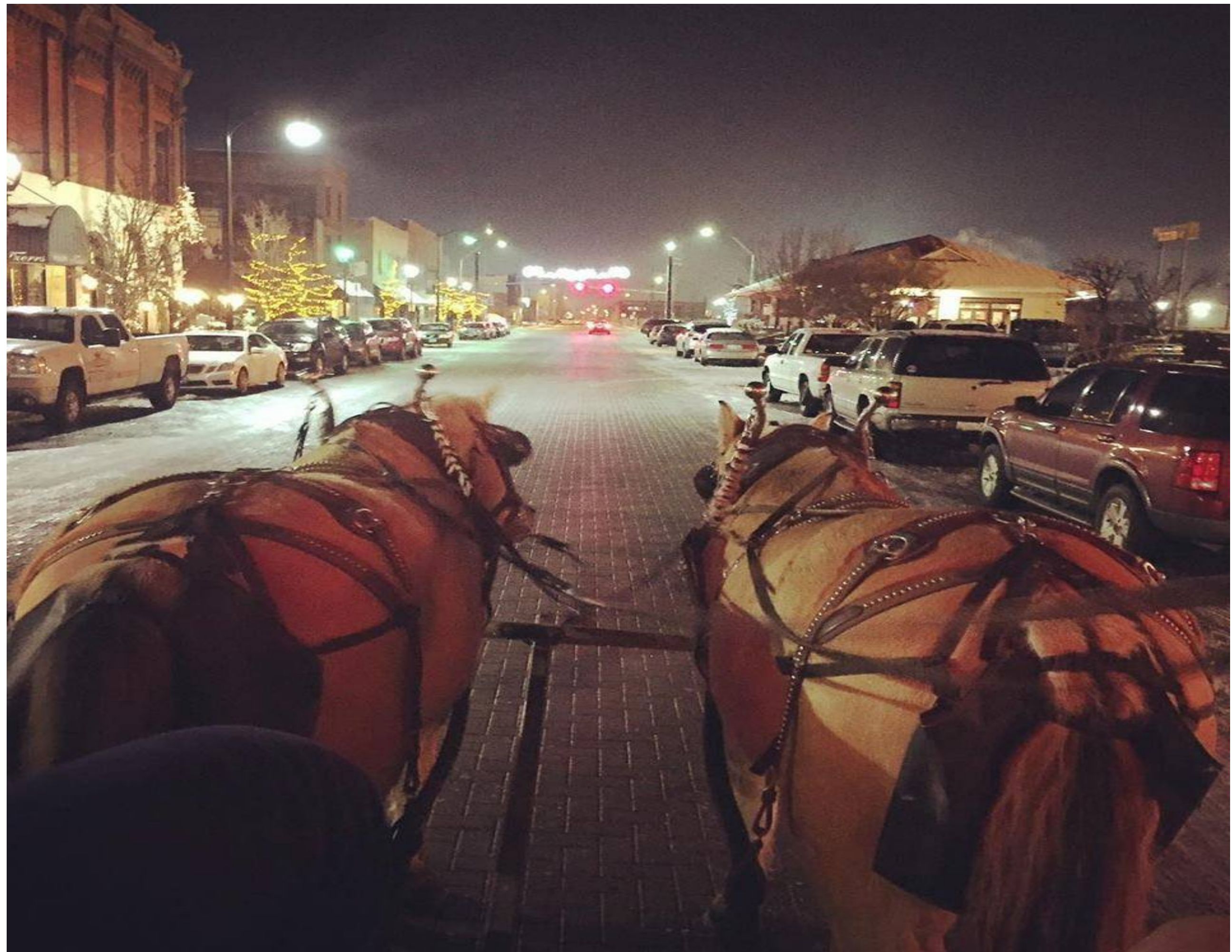
A horse-drawn wagon travels along Yakima's historic North Front Street.

The City of Yakima Municipal Court and Yakima Police Department's Services Division will close at noon on December 24. They will be closed on December 25 and January 1.