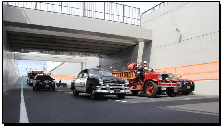
A caravan of City of Yakima vehicles, led by an antique police patrol cruiser and an antique fire pumper, helped to kick off the official opening of the MLK, Jr. Boulevard underpass in July 2014. A nearly identical underpass on Lincoln Avenue opened in May 2012. The underpass projects received a Best in State Silver Award from the American Council of Engineering Companies Washington in January.

The ACEC Washington's Engineering Excellence Awards are regarded as the Academy Awards of the engineering industry in the state. The top five award winners from this year, which include those receiving platinum or gold awards, will compete in the council's national competition in Washington, D.C. in April.