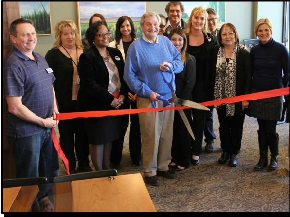
A February 2 nd ribbon cutting ceremony marked the grand opening of Hotel Maison, Yakima's newest hotel and part of the ongoing revitalization of Downtown Yakima.

In more recent years, the building at 321 East Yakima Avenue had been known as the JEM Building. Yakima-based JEM Development purchased the building several years ago. The building has sat mostly empty for many years, with the exception of parts of a few floors having been used by call centers.