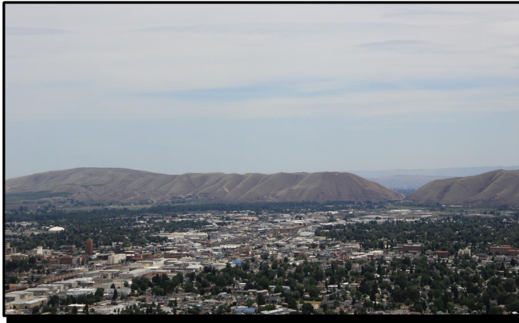
Yakima as seen from Lookout Point on the ridge between Yakima and Selah (Union Gap can be seen in the distance). Updating Yakima's Comprehensive Plan, which helps guide development, will begin with a We Are Yakima Community Vision Open House on February 23 rd at the Yakima Valley Technical Skills Center.

Throughout 2016, the City of Yakima will undertake the intensive task of updating its Comp Plan. One of the first steps in the lengthy process will be a We Are Yakima Community Vision Open House that will take place on Tuesday, February 23 rd at the Yakima Valley Technical Skills Center located at 1120 S. 18 th Street. Doors will open at 6:00 pm and the presentation will start at 6:30 pm. The event, which is being hosted by the Yakima Planning Commission, is scheduled to last until 8:00 pm.