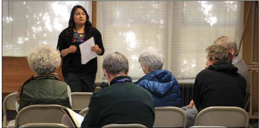
Yakima City Council members will host four neighborhood forums in seven days to gather public comment on public safety concerns.