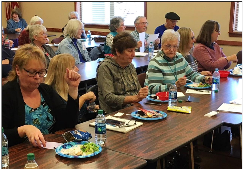
Spring 2018 will see the continuation of popular City programs, such as the Harman Center's monthly Lunch & Learn programs.

Information about the Spring Break Day Camp, as well as soccer camps for children ages 4 to 7 scheduled during Spring Break, is available at https://yakimaparks.com/summer-day-camps/