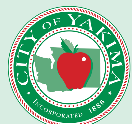
City Council Dec. 2022 summary, page 3