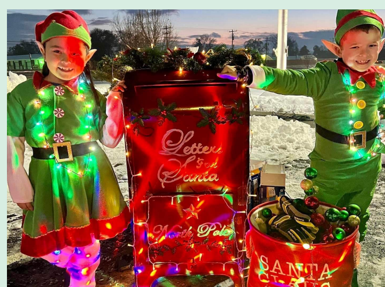
Holiday helpers page 2