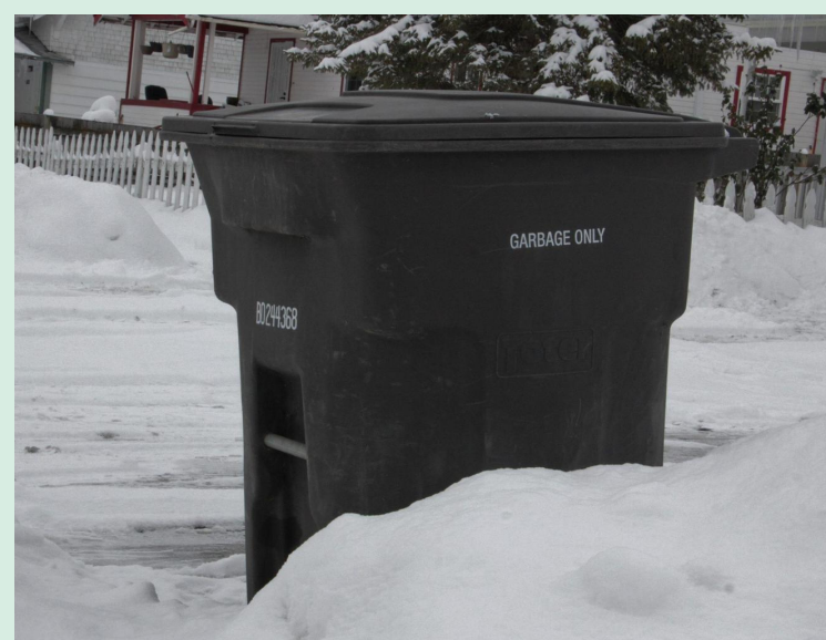
Help us help you page 2