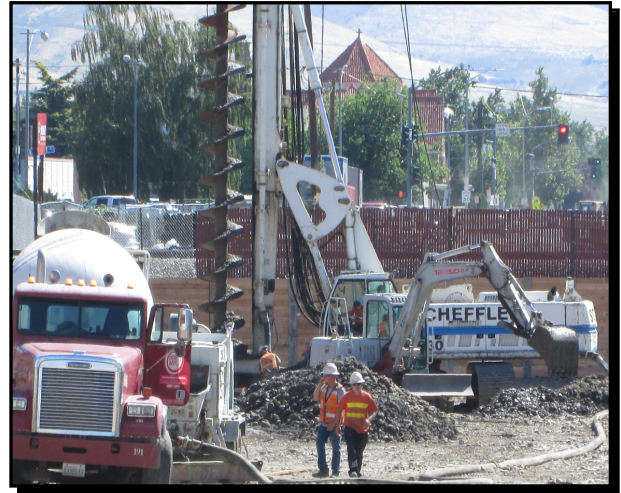
A continuous flight auger (in background) is being used to drill shafts for retaining walls and the underpass bottom seal and fill them with concrete.

The roughly $10.6 million underpass project is expected to continue until late summer or early fall of 2014 and will eventually take MLK, Jr. Blvd traffic below BNSF tracks near North Front Street. Until then, motorists on MLK, Jr. Blvd are being encouraged to turn right on 5 th Avenue and use Yakima Avenue to continue traveling east. Local access is being maintained on MLK Jr. Blvd between 5 th Avenue and 1 st Avenue.