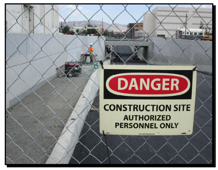
Signs of construction will soon disappear from the MLK, Jr. Blvd underpass when the roadway is opened to traffic on July 23<sup>rd</sup>. The project began last spring and was expected to take until late summer or early fall of this year to complete.

Reopening MLK, Jr. Blvd will restore a primary link to Downtown Yakima and relieve traffic congestion caused by detouring vehicles around the construction