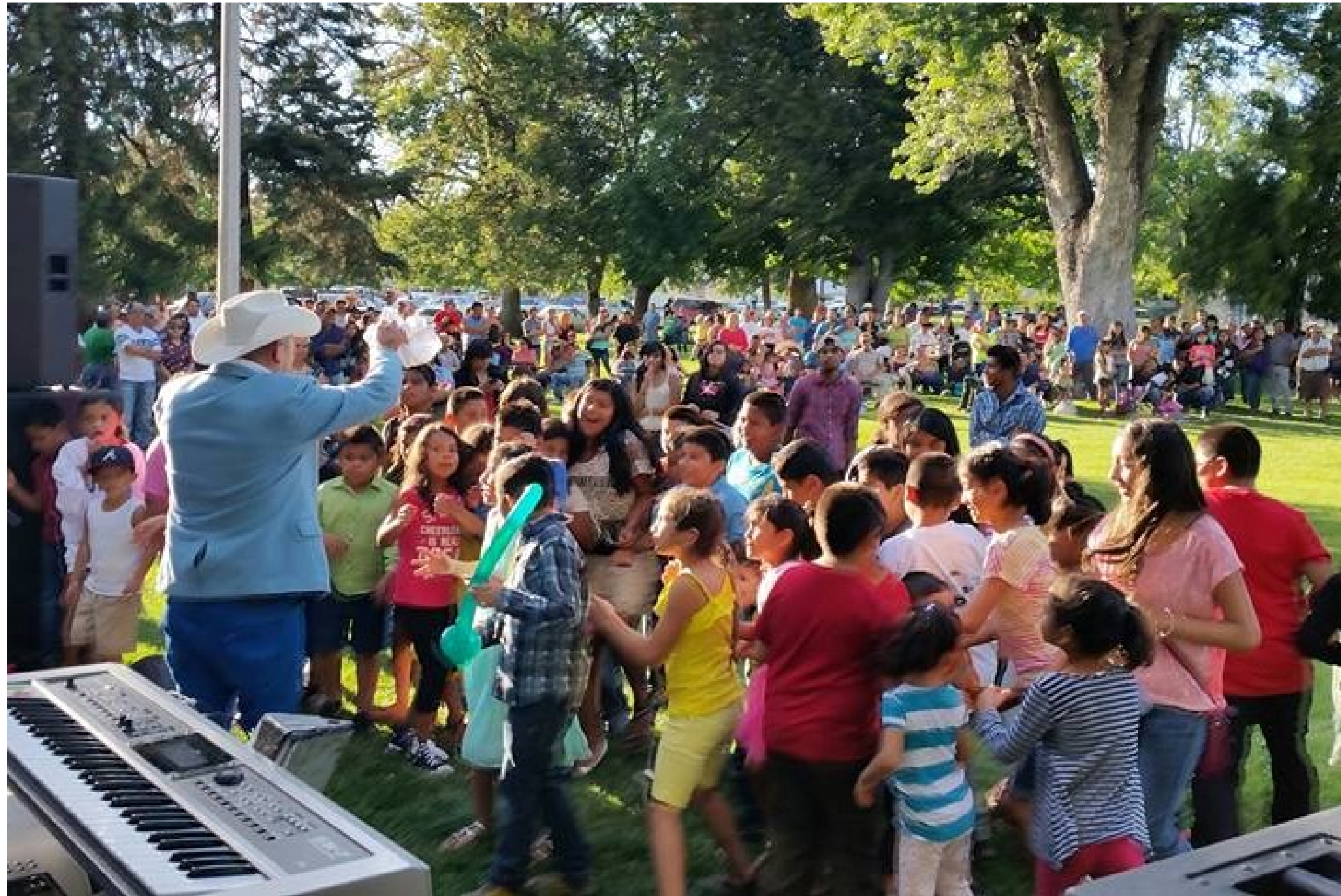
Viva La Musica returns to Miller Park and Martin Luther King Jr. Park this summer