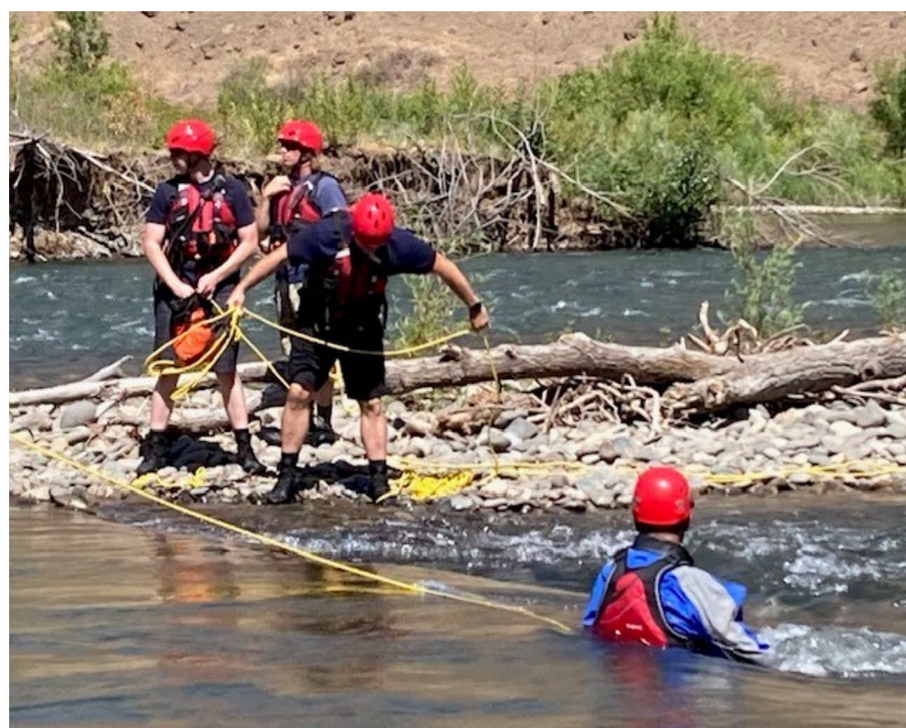
YFD conducted swift water rescue training during the month of June.

The Yakima Fire Department (YFD) offers a number of water safety resources and suggestions as residents head out to the water, whether it be a back yard pool or local rivers, lakes and streams.