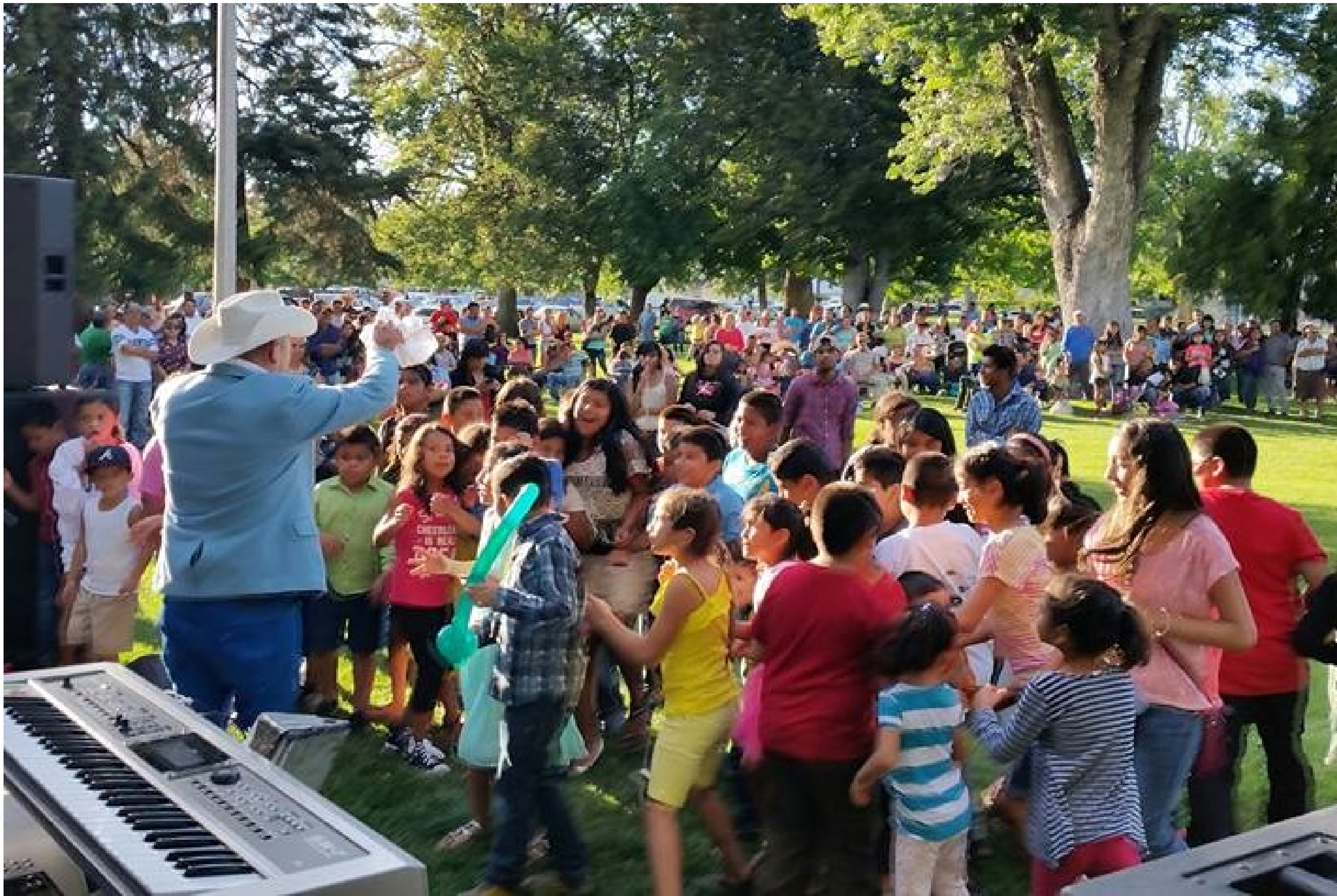
Viva La Musica returns to Miller Park and Martin Luther King Jr. Park this summer

Yakima Parks & Recreation offers free music and outdoor movies beginning July 8th