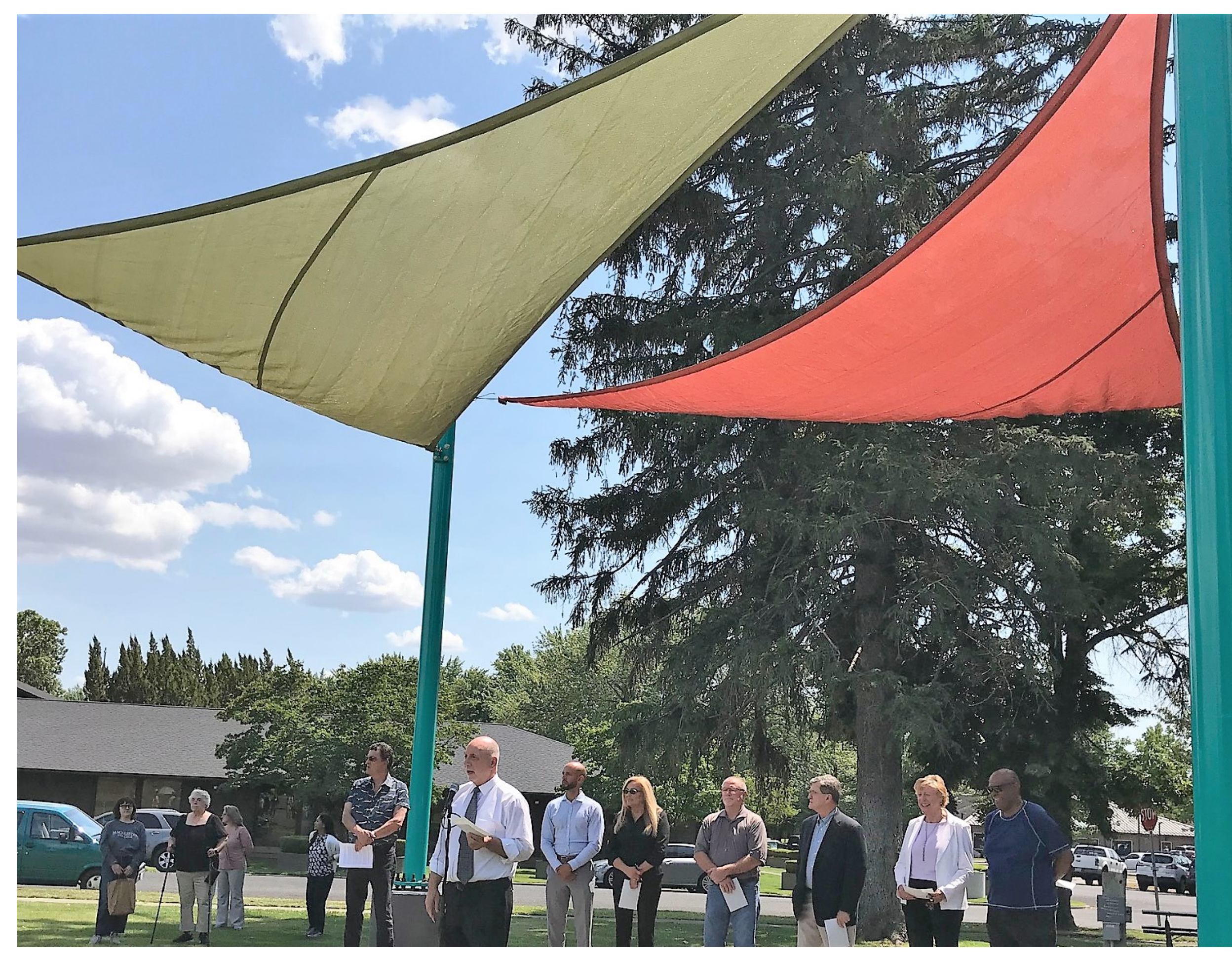
The near restances as an a thiller Deule will be at some of the Viere I.

The Viva La Musica concert series finale for 2023 will be 4 pm to 7 pm on Sunday, Sept. 10th, at Miller Park. The concert will feature bands Raza Michoacana as well as Los Hermanos Gonzales.