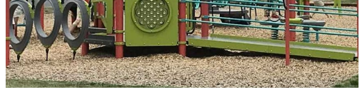
A ribbon-cutting with state and local community partners on June 22 marked completion of work at Miller Park.

Completion of a project nearly three years in the making was celebrated June 22nd with a ribbon-cutting ceremony at Miller Park.