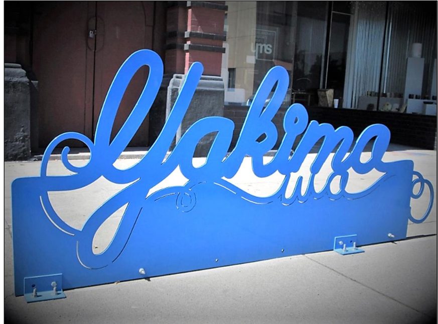
The City of Yakima's Bike and Pedestrian Advisory Committee is conducting an inventory of bike racks in the City like this one on South First Street.

"The application is pretty easy to use and is compatible with mobile devices," said City of