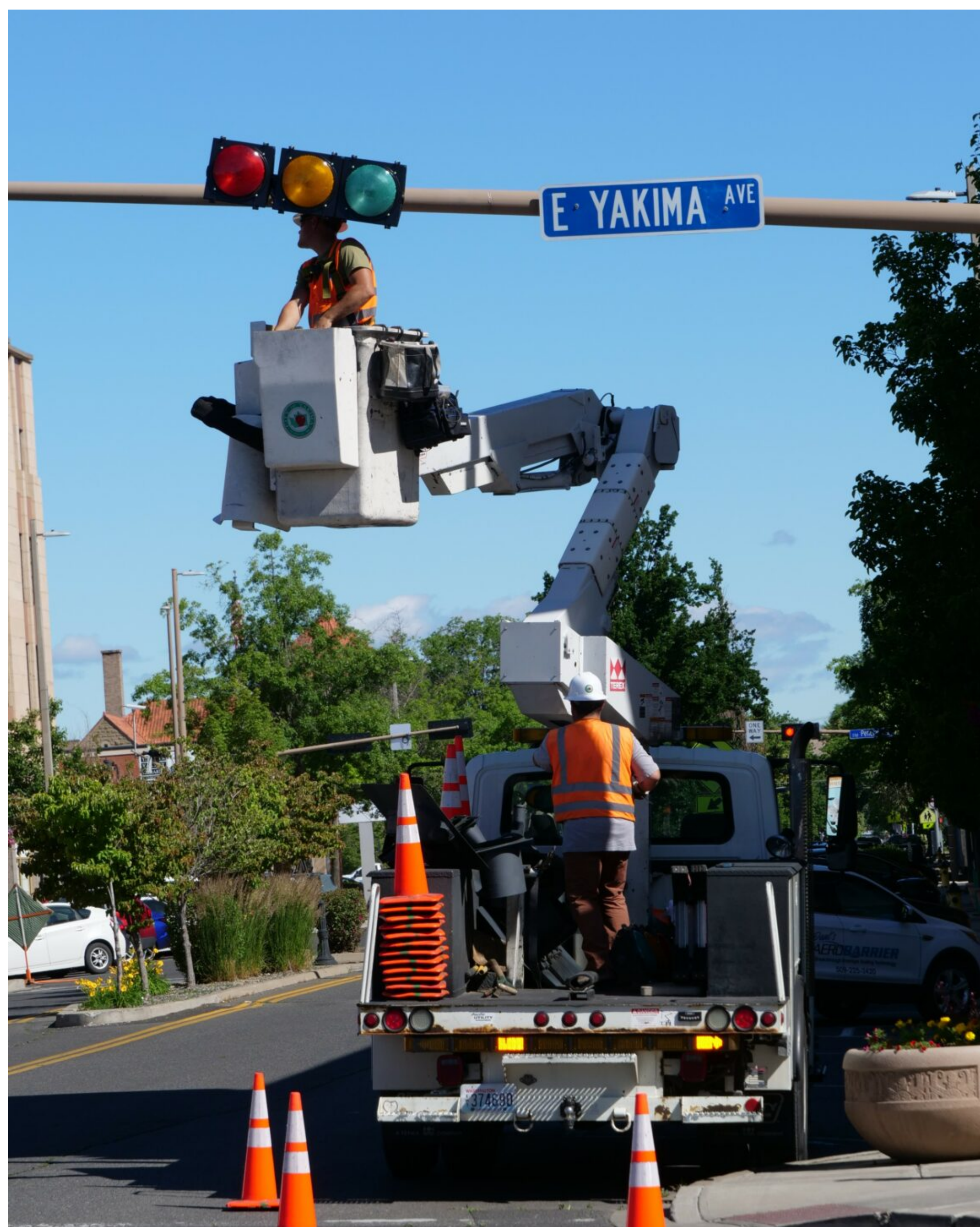
City of Yakima crews are pictured last summer during a series of traffic signal upgrades along Yakima Avenue. Crews are upgrading additional signals this summer.