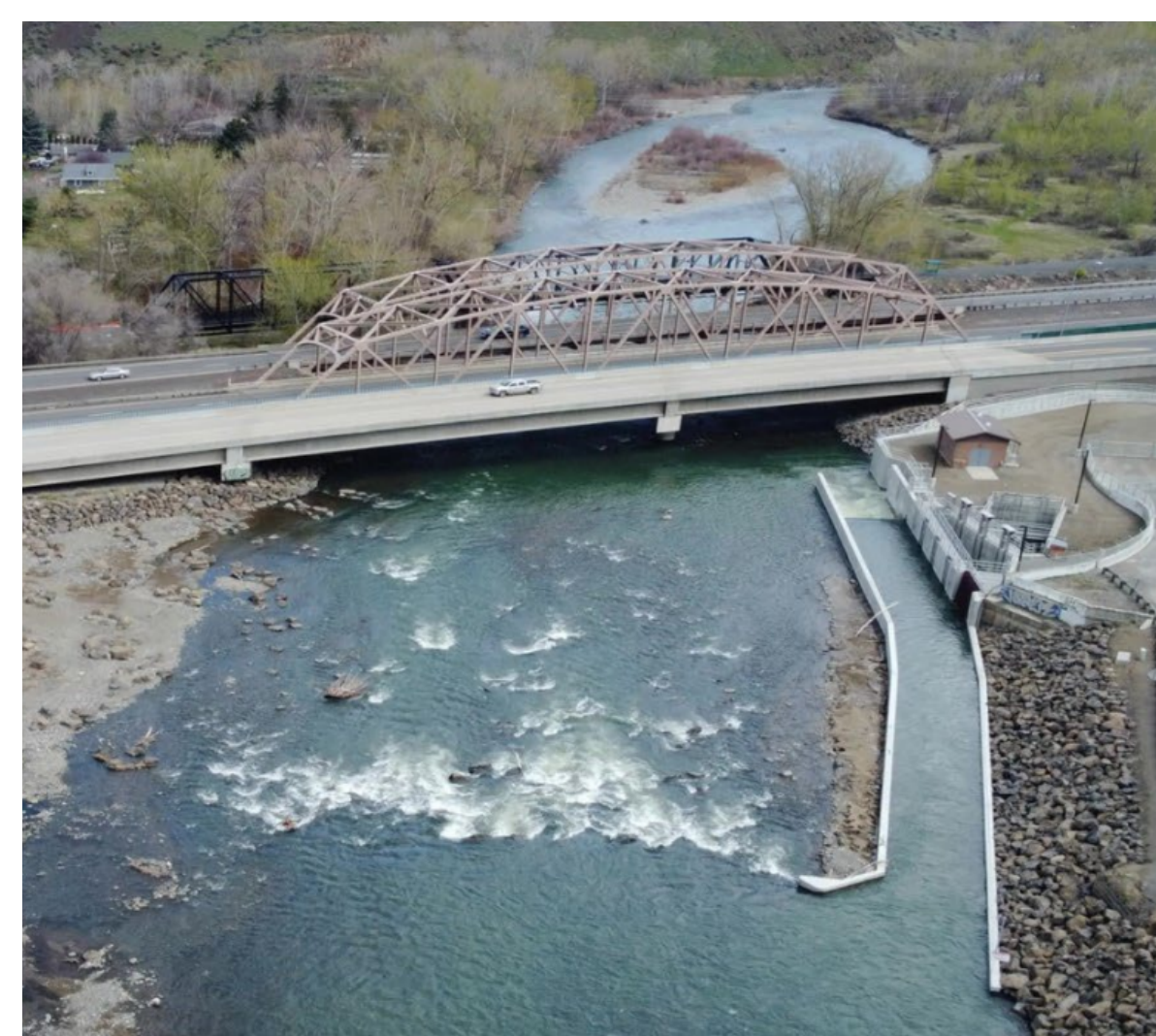
Naches River before (top) and after Phase I of the Nelson Project

Removal of Nelson Dam enables the next undertaking, the Cowiche Confluence Complex project.