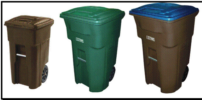
A 32-gallon garbage cart (left), a 96-gallon yard waste cart (center), and a 96-gallon recycling cart (right) will be provided to 600 pilot project homes.

The pilot project will run from May 6 th through August 29 th . The project will be conducted in neighborhoods east and north of Kissel Park (3000 West Mead Avenue). Homes in the pilot project area will receive free curbside recycling during the test period.