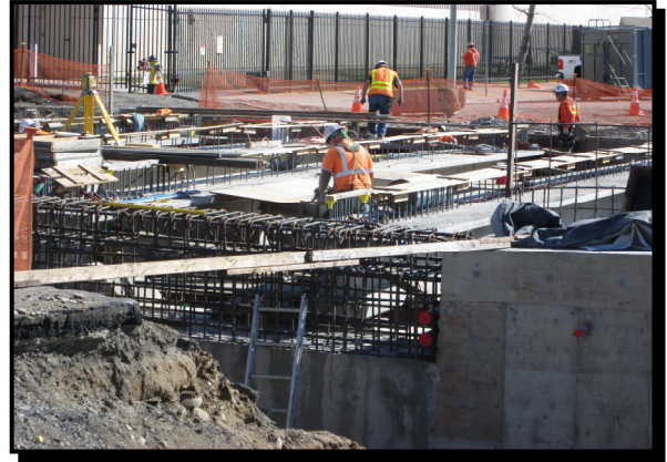
Work is underway on the North Front Street bridge, which will carry car traffic above the MLK, Jr. Blvd underpass.

On the east side of the tracks, girders are now in place that will allow for construction to begin on the North Front Street Bridge that will cross over the underpass. The bridge should be finished in 4 to 6 weeks, but will remain closed to traffic until the entire underpass project is completed.