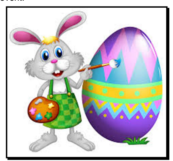
As part of his holiday schedule, the Easter Bunny will stop by the Harman Center on April 8<sup>th</sup> for breakfast.

With Easter fast approaching, preparations are underway for Yakima to welcome a very special visitor. The Easter Bunny will skip into town and make a hop stop at Yakimacs Harman Senior Center on Saturday, April 8<sup>th</sup> for a special & reakfast with the Easter Bunny and Easter Egg Hunt+ event.