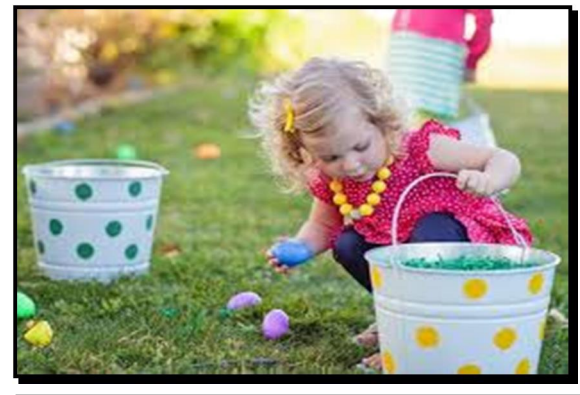
The Easter Bunny's Harman Center visit on April 8<sup>th</sup> will include an Easter egg hunt at 9:30 am.

People who plan on attending the special %Breakfast with the Easter Bunny and Easter Egg Hunt+event at the Harman Center on Saturday, April 8<sup>th</sup> are being asked to make reservations by calling 575-6166.