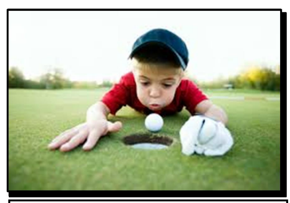
Golfers of all ages help make Fisher Park Golf Course one of the most family-friendly courses in the Yakima area.

From opening day (March 31<sup>st</sup>) through May 26<sup>th</sup>, anyone can play a round of 9 holes for $7.00. On LadiesqDay (every Tuesday) and Mencs Day (every Thursday), 9 holes will cost only $7.00 for eligible golfers. On Senior CitizensqDay (every Monday), eligible golfers will pay just $5.00 for 9