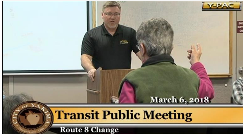
Yakima Transit is holding a series of public meetings about the new Route 8, which will begin service on Monday, April 30th. It will replace Route 10, which makes its last run on April 30th. The first meeting, pictured above, can be viewed on-line at Y-PAC's website.