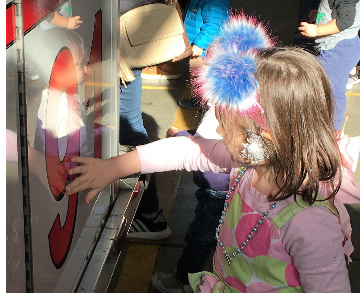
In February, Yakima Fire Department Station 91 hosted a tour for 28 pre-school students from Central Lutheran Cooperative Preschool of Yakima. Teachers and parents joined the children on the tour led by Station 91 staff. Click https://yakimafire.com/request/ to schedule your Yakima Fire Department tour.