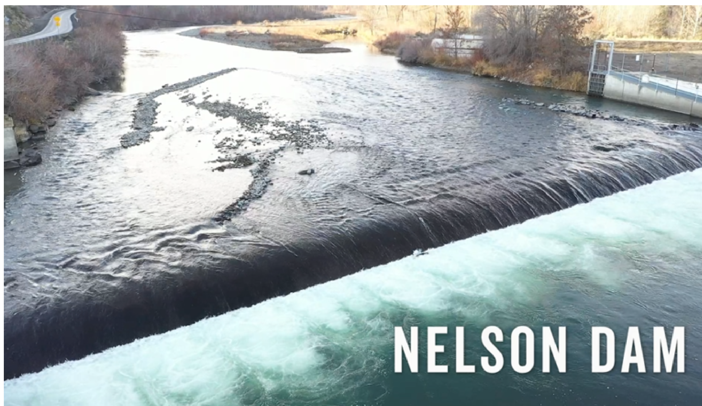
Above: A screen shot of the Nelson Dam project video available on the City of Yakima website.