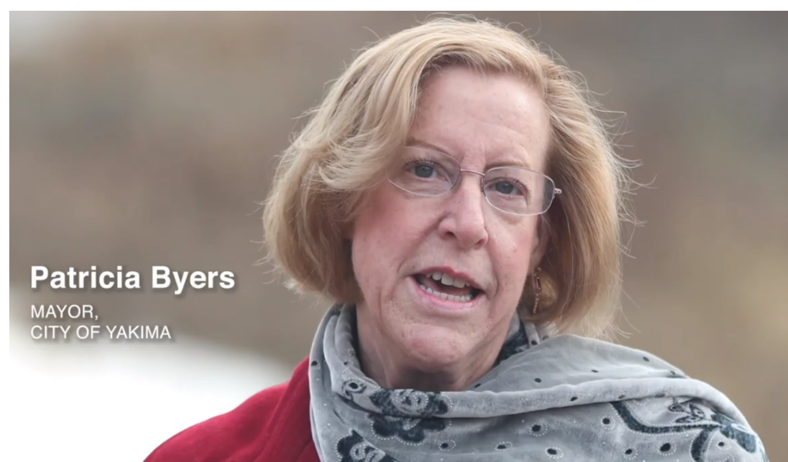
At right: A screen shot from the video showing Yakima Mayor Patricia Byers discussing the Nelson Dam project's economic benefits.

The City of Yakima is working on a project to remove Nelson Dam to improve fish passage and water reliability. Last month the City debuted a video detailing the project and its benefits. Project details and the video are available at Nelson Dam Project | Points of Interest (yakimawa.gov) .