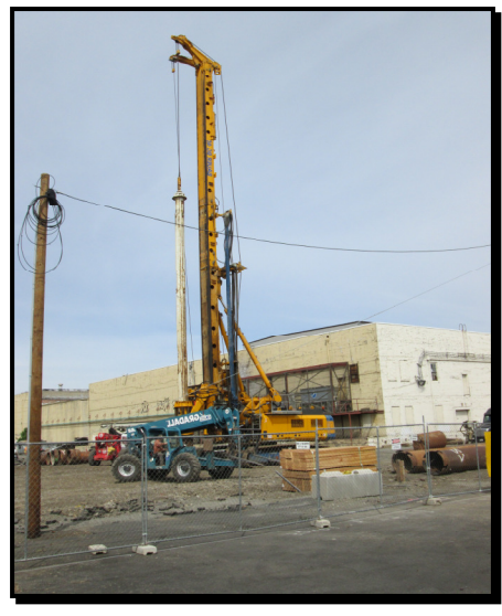
A 70-foot tall drilling rig towers over the MLK, Jr. Blvd underpass construction site.

The focus of the project will soon be shifting to construction of a temporary track, commonly referred to as a "shoo-fly", that will be used as a detour for BNSF trains while the underpass project is ongoing. Mowat Construction Company, the Woodinville-based firm serving as the project's primary contractor, has completed the initial work of building a stable bed for the temporary track. Once the track bed is finished, BSNF crews will take over and install new tracks for the shoo-fly and put it into service to handle mainline train traffic through Yakima.