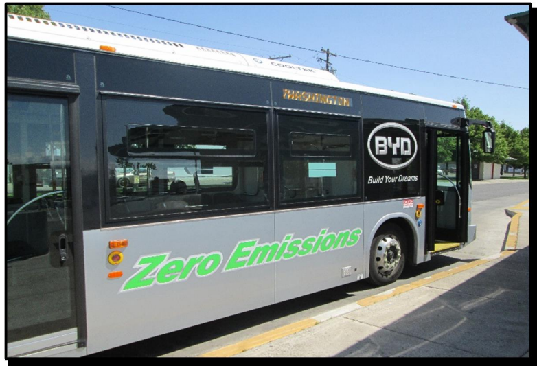
A BYD Motors, Inc. battery-powered bus is being test driven along Yakima transit routes. The bus was also tested in Spokane and the Tri-Cities earlier this year.

The 40-passenger electric bus can operate up to 10 hours between charges and reach a top speed of 45 miles per hour, with a range of 155 miles. A 324 kilowatt-hour, iron-phosphate battery powers the bus, which was built at a plant in Lancaster, California.