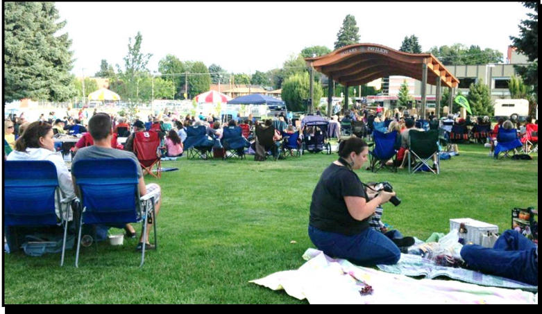
The Yakima Sunrise Rotary Pavilion at Franklin Park is the site for the Summer Sunset Concert Series. This year's series will run from July 11 th through August 15 th . All shows begin at 6:30 pm and will last until 8:30 pm.

In addition, the new Viva La Musica Concert Series will make its debut this summer.