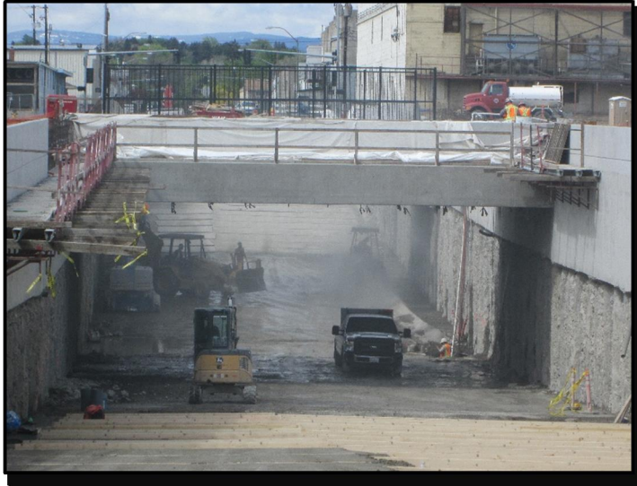
The new North Front Street bridge above the MLK, Jr. Blvd underpass now stands freely. Another bridge, which will carry BNSF train traffic, is also complete.

Anyone driving past the MLK, Jr. Boulevard underpass construction site can help but notice a sure sign that the roughly $10.6 million project is moving forward toward completion. Recently, for the first time since the project began in early 2013, dirt was cleared from beneath two newly-built bridges allowing construction vehicles to travel from one end of the underpass to the other.