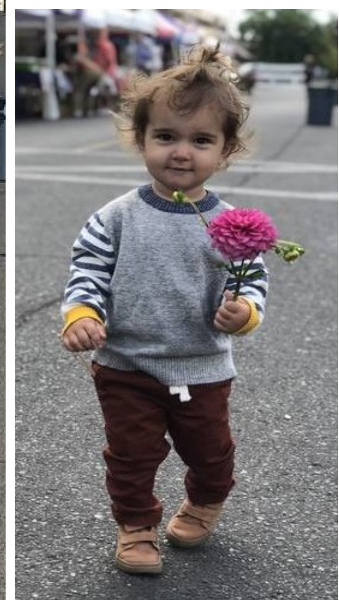
Farmers Market