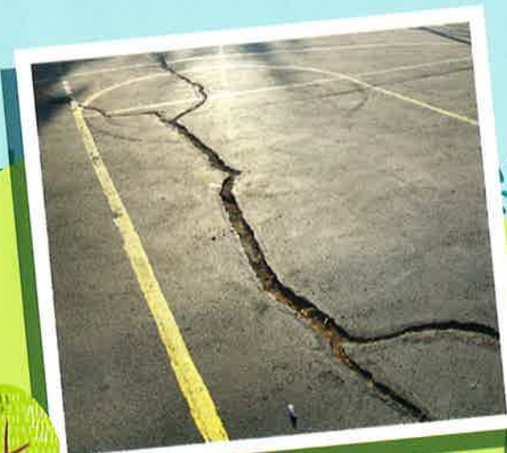
Hazardous cracks and uneven surfaces

“Revitalizing Miller Park as the heart of the community.”