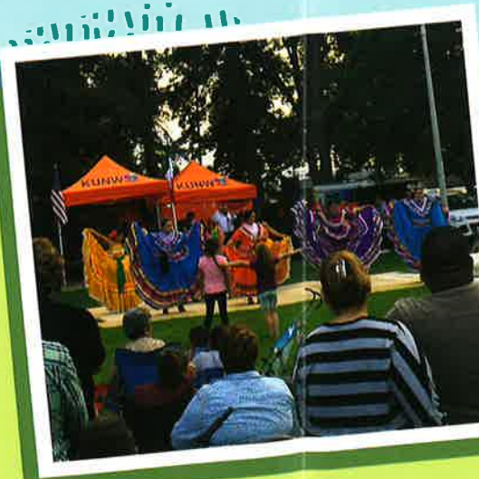
No covered performance area, electricity, or restrooms