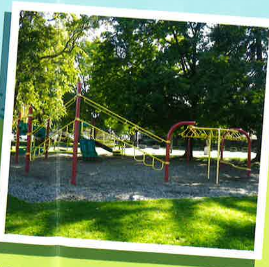
No ADA-Accessible play features