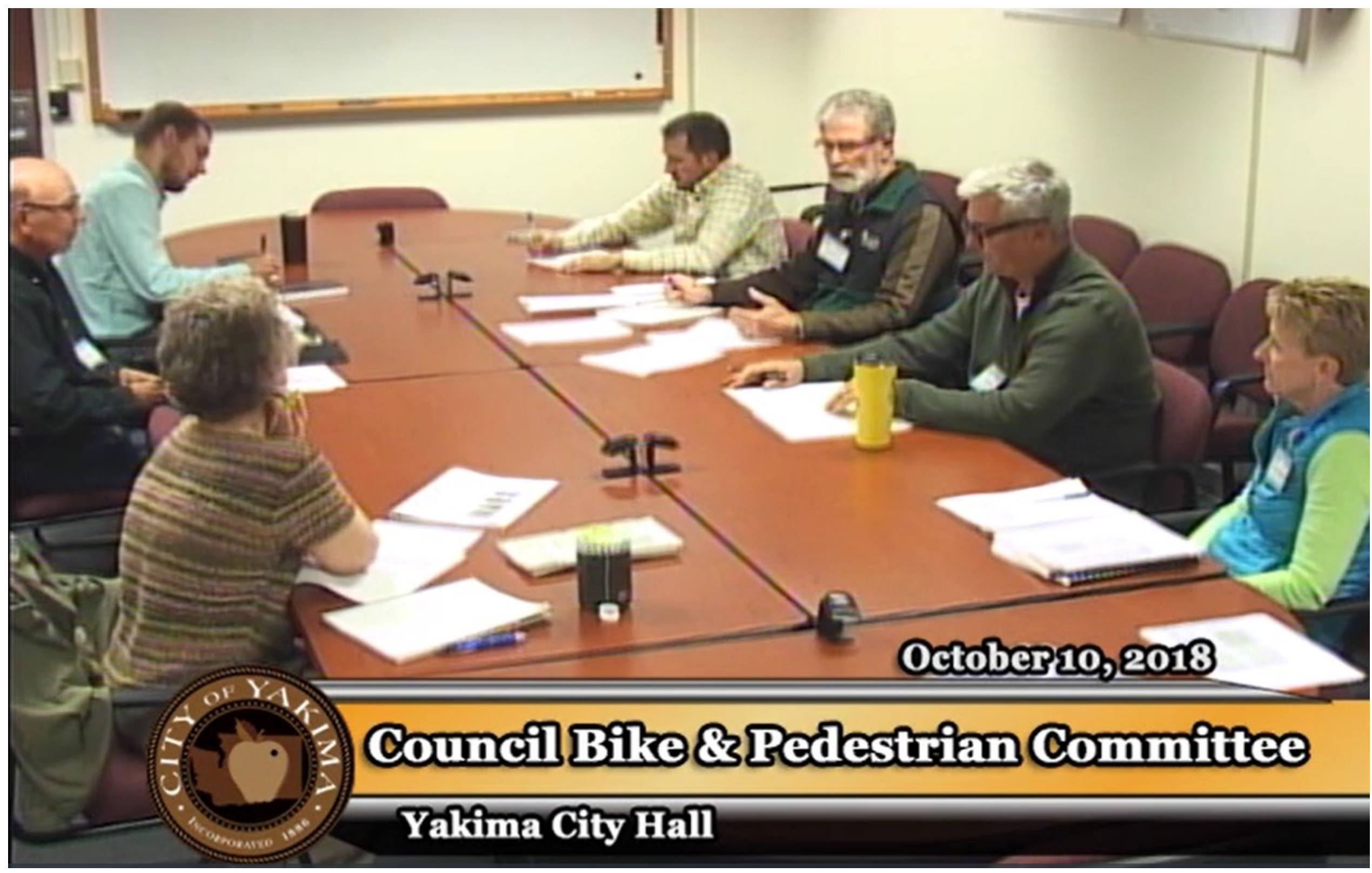
The Bike & Pedestrian Committee is among the volunteer opportunities.

New, unwrapped toys can be brought to the the Harman Center front desk through Dec. 14.