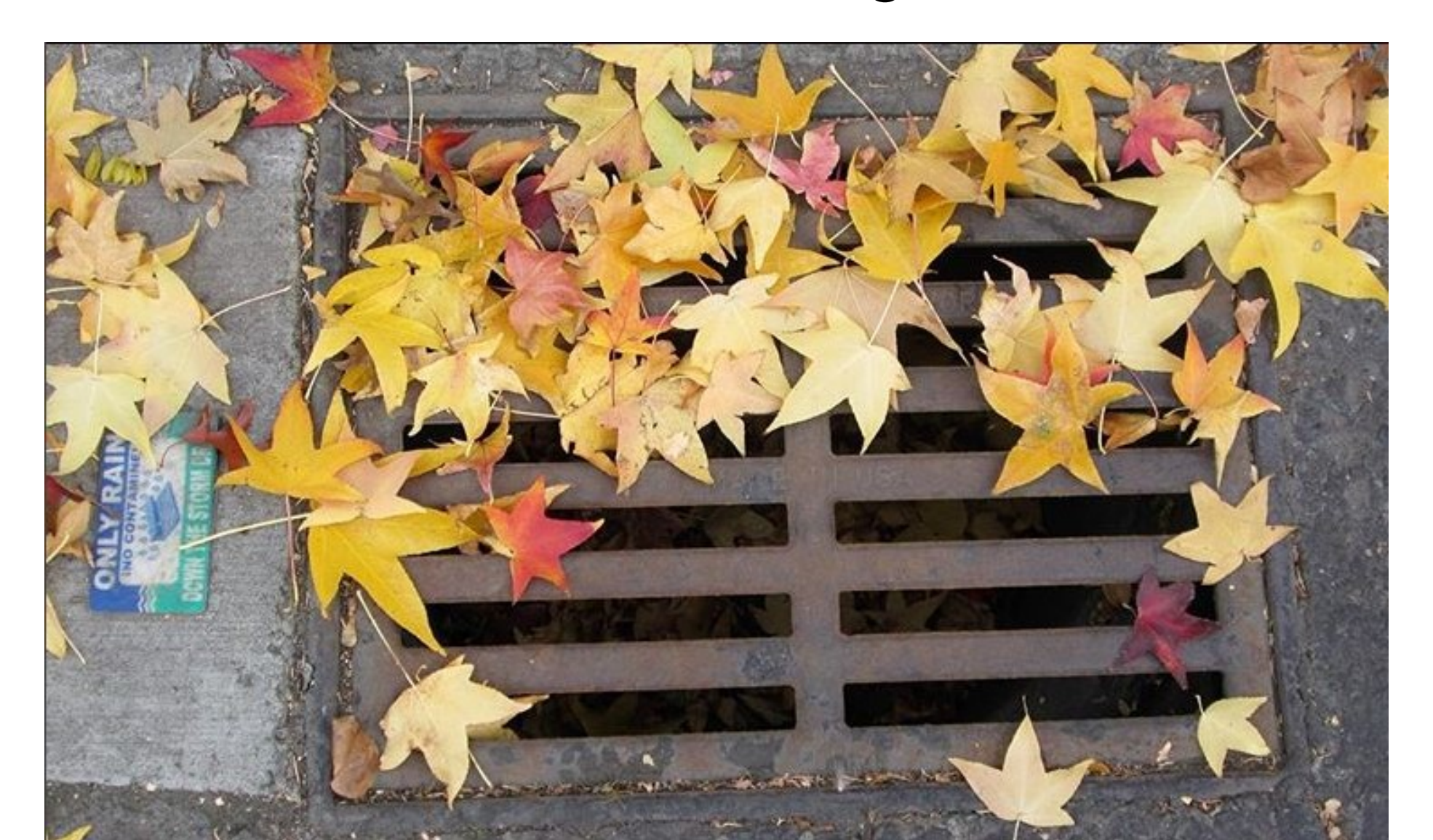
Yakima City Code forbids sweeping leaves and yard debris onto streets, gutters and sidewalks due to issues with leaves clogging storm drains.

The City of Yakima is offering leaf disposal options for residents through the City's Refuse Division, which offers yard waste collection through November 30th.