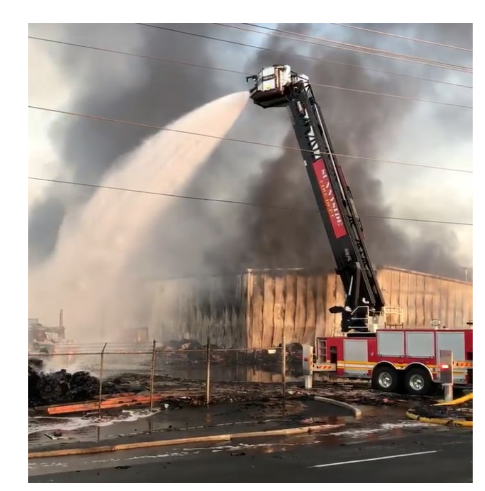
Fruit Packers Supply, 1102 N. 16th Ave., was the site of two suspicious fires in August that occurred about 48 hours apart. Damages were estimated at $21 million or more.

Nearly 30 suspicious fires were reported during a six-week span