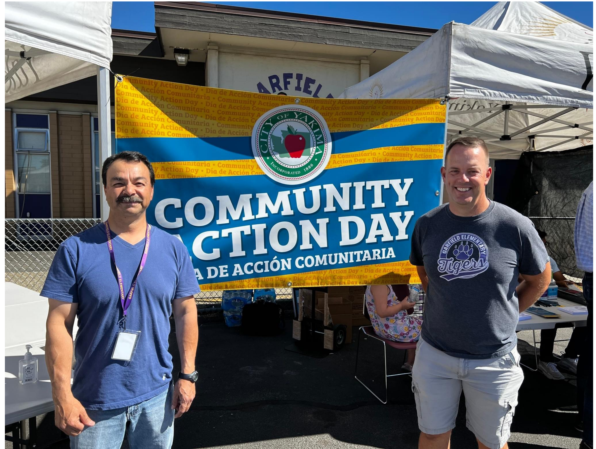
Photo from the City of Yakima's first Community Action Day, held on July 23rd at Garfield Elementary School.