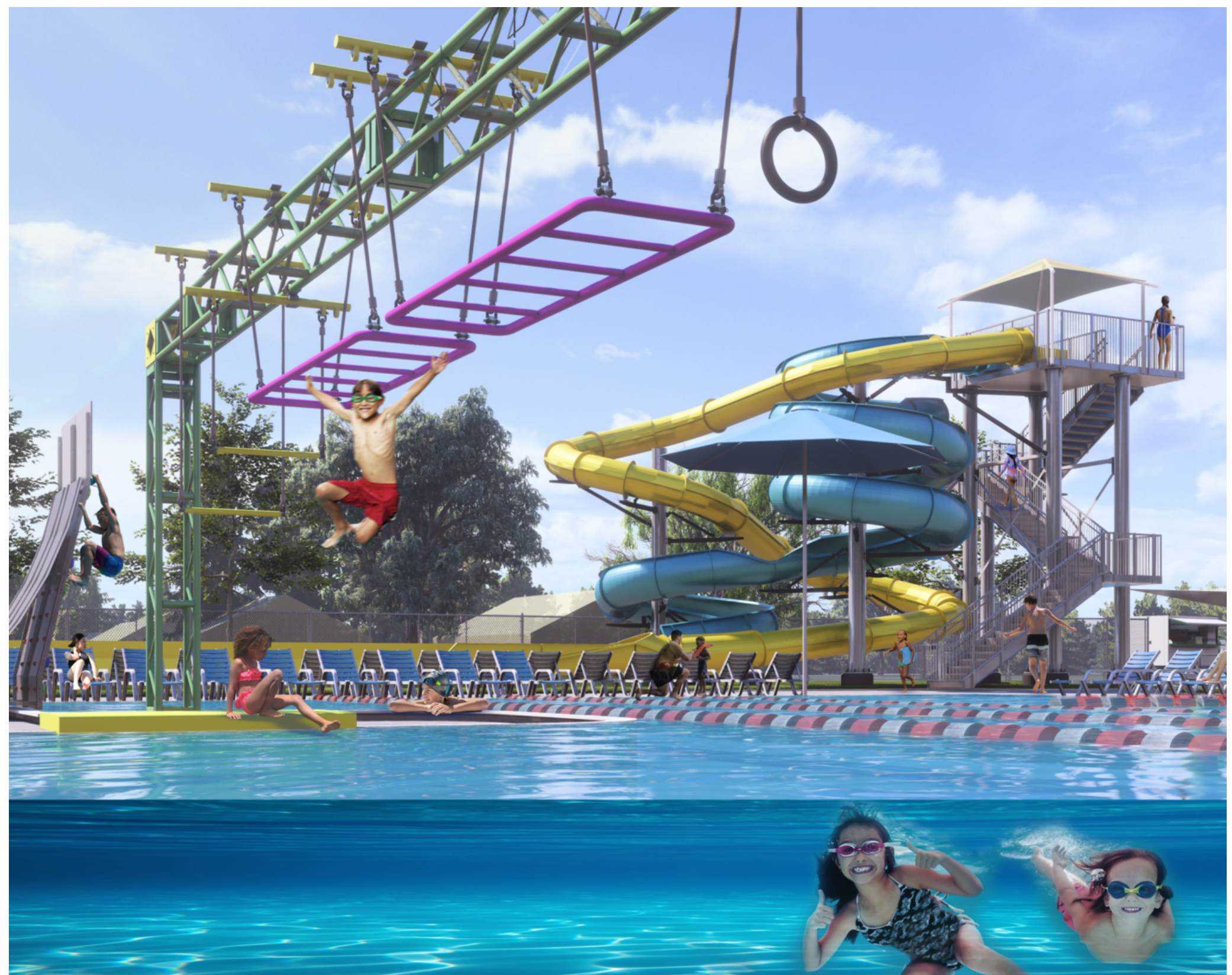
Artist's rendering of the aquatic center at Martin Luther King Jr. Park

The estimated cost of the aquatic center is about $11 million. The City and Yakima County have each committed $3 million to the project. The Washington State Legislature has also contributed more than $2 million to the aquatic center.