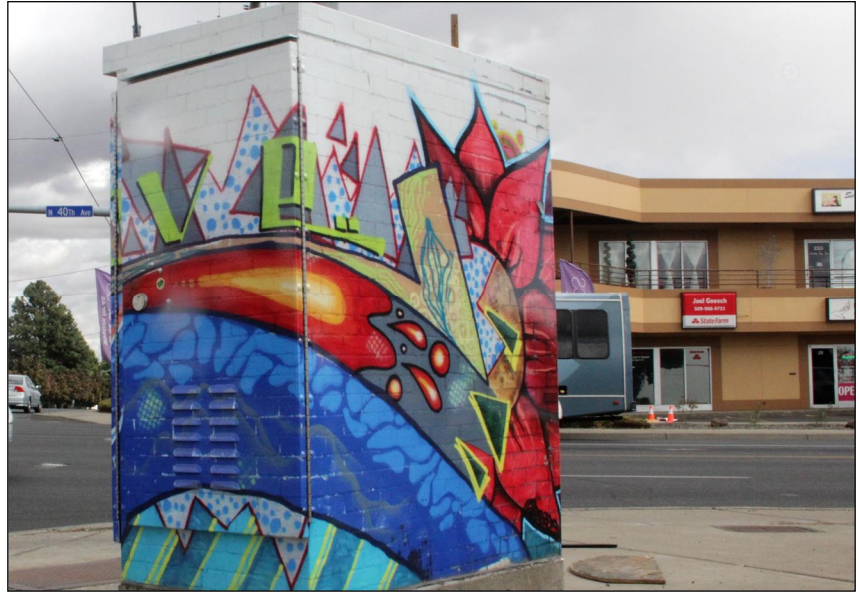
This traffic signal control box at 40 th Avenue and Summitview Avenue in Yakima was recently wrapped in artwork created by a local artist