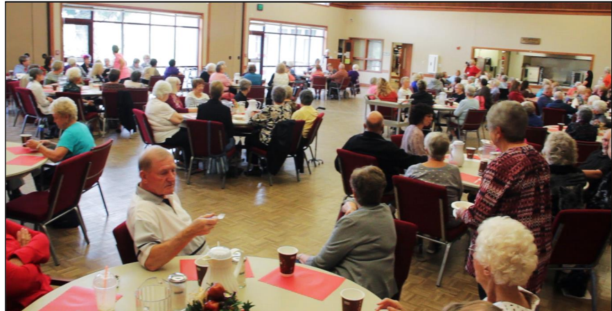
The City of Yakima's Harman Center had a full house last month during an apple crisp/style show to kick off the fall season.