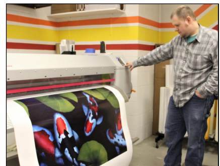
The City of Yakima's sign shop prints and installs the artistic wraps after designs are approved by the Yakima Arts Commission.

It then sends the selections over to the City of Yakima sign shop, which prints and installs the artwork.