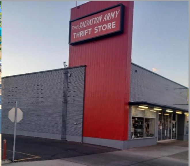
Salvation Army Store