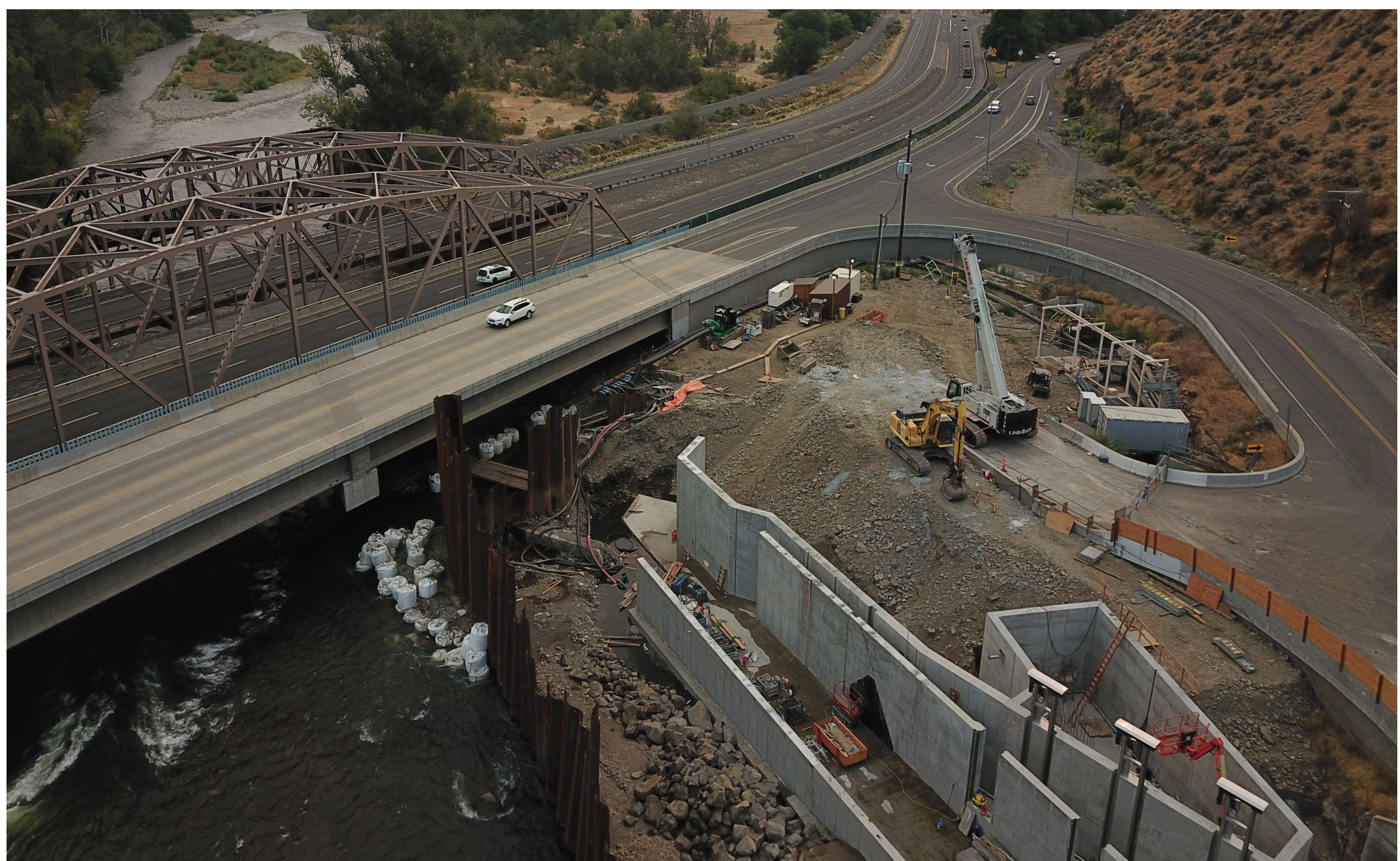
South Naches Road will be reduced to one lane for much of September due to construction of a new fish screen structure and rip-rap installation in the above photo courtesy of Yakima County.

The diversion structure, known as a roughened channel, will not only aid fish but also help with flood mitigation. “It will make a much bigger pathway so all that sediment trapped up above will start moving, lowering the flood risk,” said Assistant Public Works Director Dave Brown.