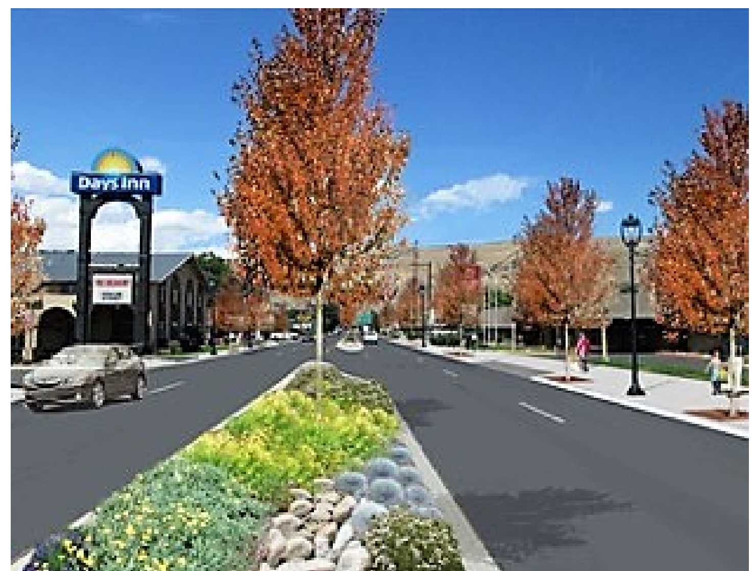
The North 1st Street revitalization project was the focus of a listening session held last month by area business owners and the Yakima City Council. Above is an artist's rendering of the completed project.