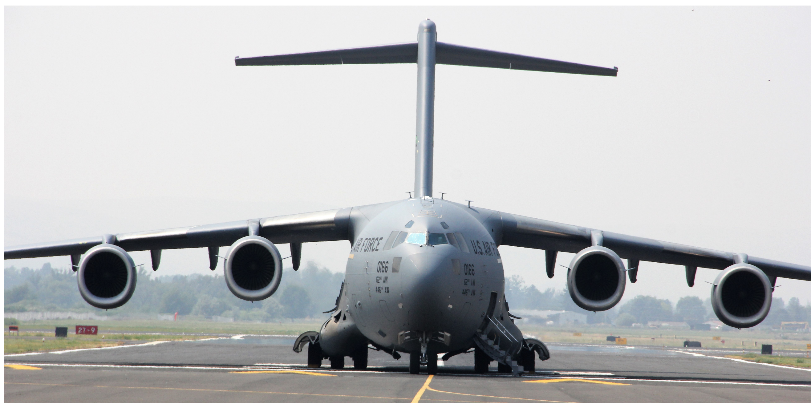
A U.S. Air Force aircraft is pictured at Yakima Air Terminal-McAllister Field during the first "Operation Mobility Guardian" exercise in August 2017.