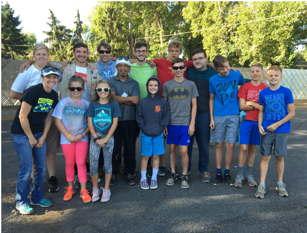
Picture from August 26th Eagle Scout Graffiti cleanup project.