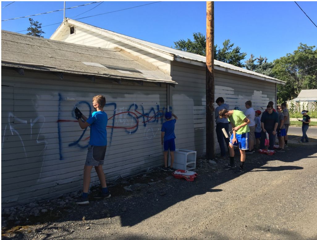
Picture from August 26th Eagle Scout Graffiti cleanup project.