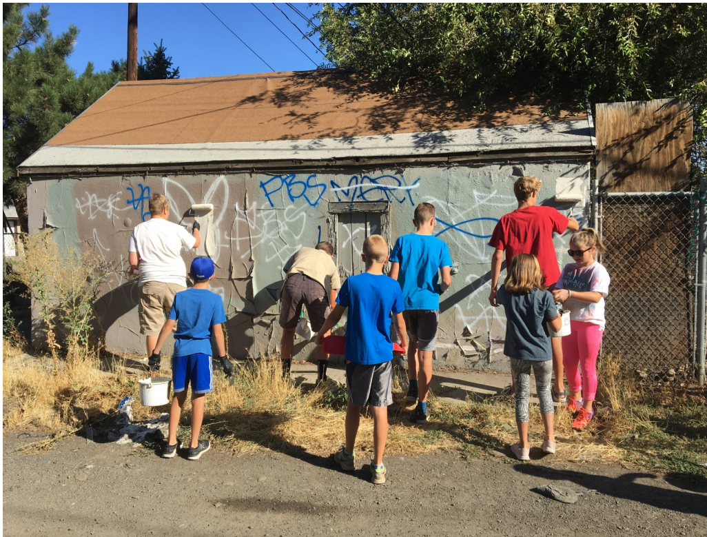
Picture from August 26th Eagle Scout Graffiti cleanup project.