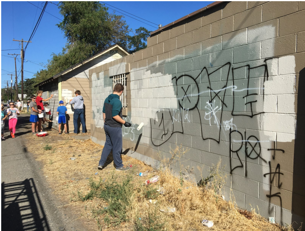
Picture from August 26th Eagle Scout Graffiti cleanup project.