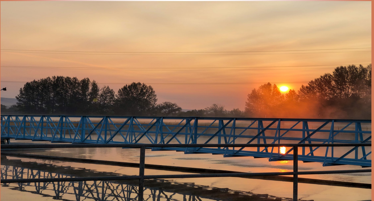
Sunrise over City of Yakima Wastewater Treatment Plant Clarifier

The City of Yakima Wishes You Success for the New Year!