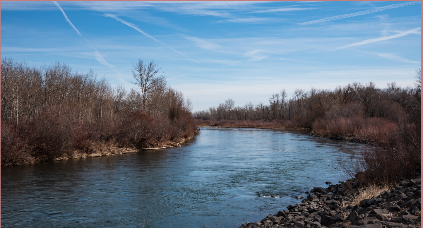
The location of our outfall mixing zone in the Yakima River

The City of Yakima Wishes You Success for the New Year!